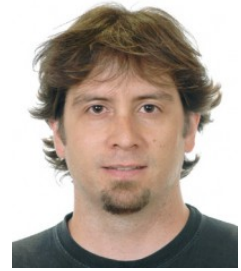
Ficha del Directorio