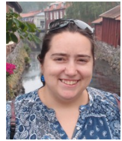
Ficha del Directorio