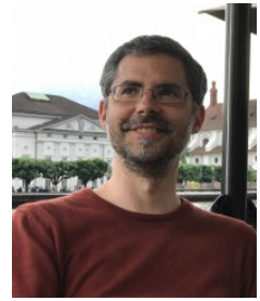
Ficha del Directorio