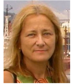
Ficha del Directorio

Grupo de Investigación: ESTUDIO SUSTANCIAS ANTAGONISTAS PRODUCIDAS POR MICROORGANISMOS (Cod.: BIO160)