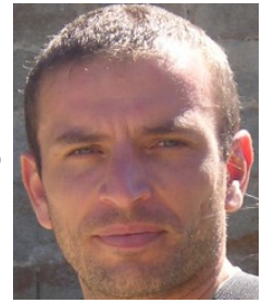
Ficha del Directorio